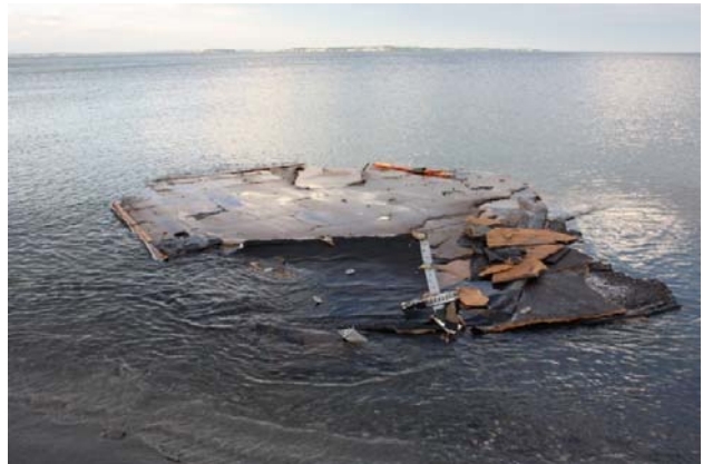
Revere, roof that blew off, in Revere Beach