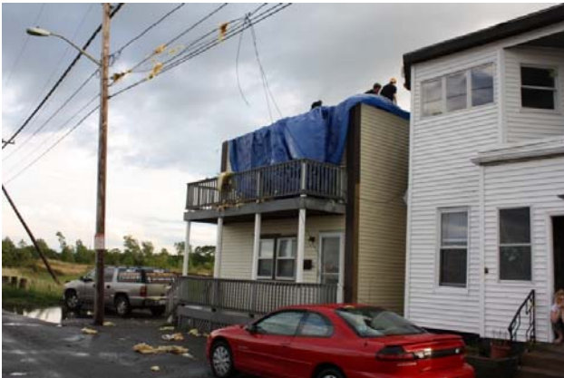
Revere, Winthrop Parkway, roof blew off