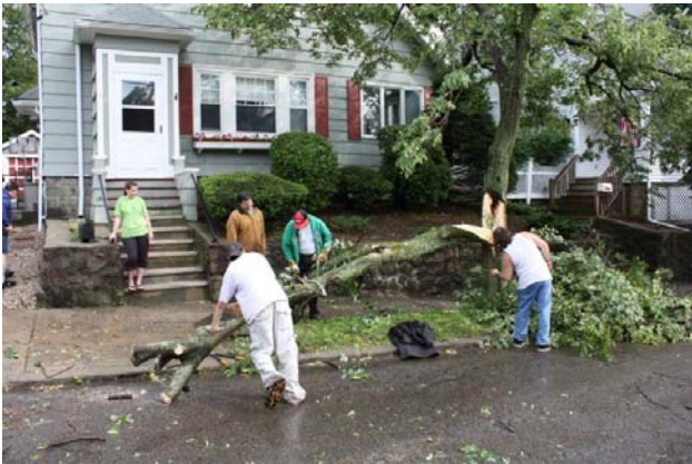
Lynn, Woodland St