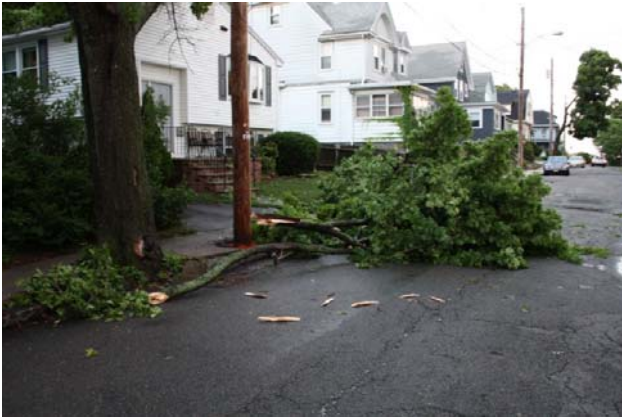
Winthrop, Seaview Ave