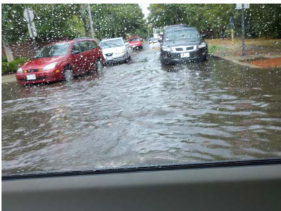
Salem, Federal at Washington St