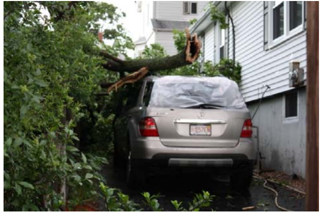
Winthrop, Seaview Ave