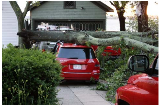
Winthrop, Pleasant St