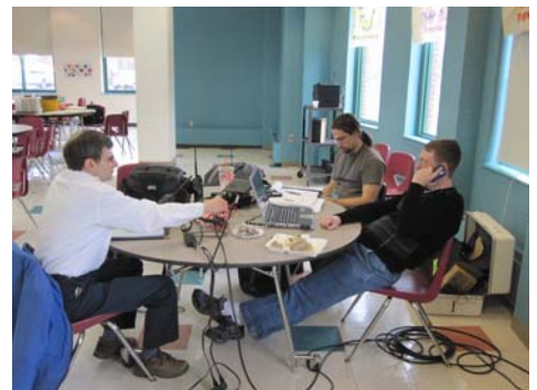
ARES Activation weekend of February 27th & 28th